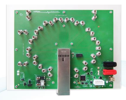
Figure 2: ML4064-MCB-112