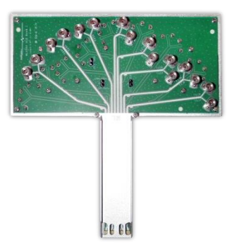
Figure 4: ML4064-HCB-112