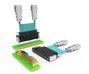
Figure 3: 8 channel coreHC to 1.85mm cable