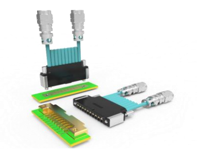
Figure 3: 8 channel coreHC to 1.85mm cable