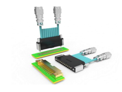
Figure 3: 8 channel coreHC to 1.85mm cable