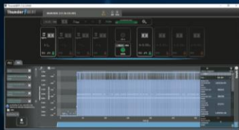
Hardware FEC Understand Real DUT Performance