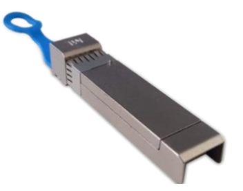
Figure 5: ML4022-LB