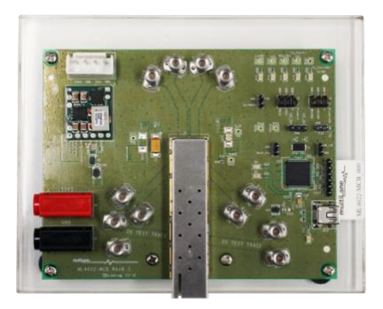
Figure 2: ML4022-MCB