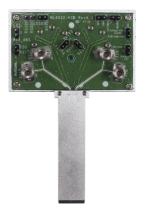
Figure 4: ML4022-HCB